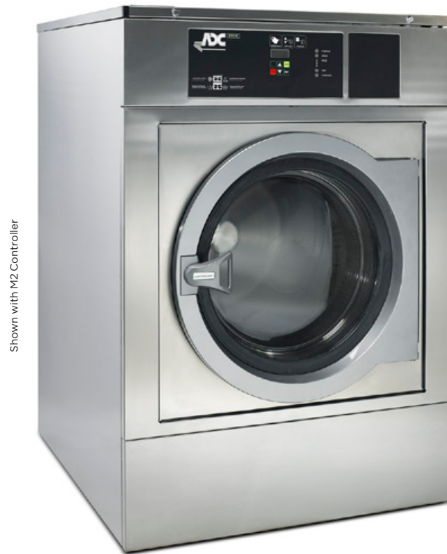
Shown with M2 Controller

EWS-25M2 EWS-30M2 EWS-40M2 EWS-60M2 EWS-80M2